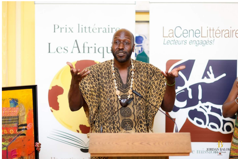
Kei MILLER (Jamaica) PRIZE winner for Africa 2018

The presentation of the Les Afriques PRIZE is organised as part of a cultural event. It takes place in the presence of the Organiser, the winning author, readers, partners, media and other invited guests. It takes place in June.